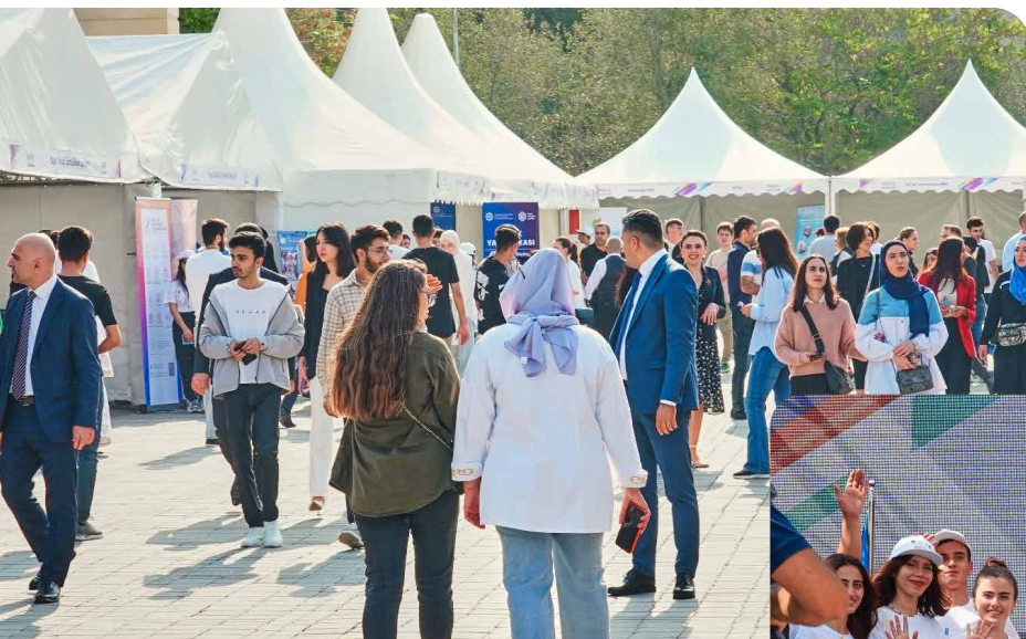
Khirdalan Job Fair – “1001 İş”

At the fair, career specialists provided free consultation sessions to the youth and helped them with CV writing, interview tips and networking. Being one of the frontrunner cities under the M4EG network, the Khirdalan Municipality will continue its efforts to support youth while involving the private sector and other agents to further sustainable development of the area.