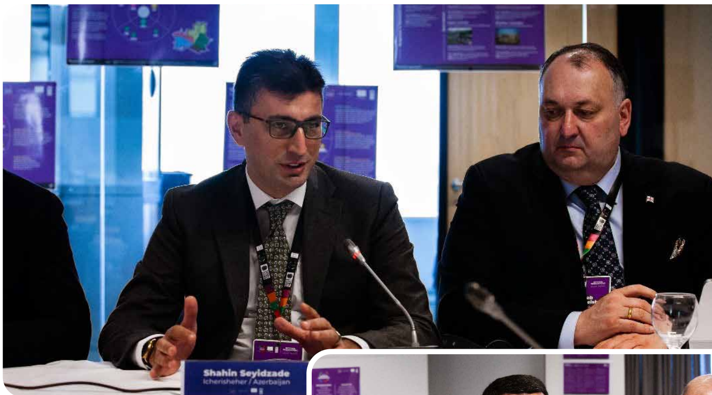
Icherisheher Administration at the Regional Sensemaking Workshop organized by M4EG in April 2023 in Brussels, Belgium.

“Participating at the regional workshop was an interesting experience for us. It gave us a platform to represent Azerbaijani municipalities at international stage. At that time, we just finished designing our portfolio, so it was interesting to see how others implemented their interventions and what were their learning. This helped us to be wary of challenges that were ahead of us and gave us inspiration to push forward on our own ideas,”