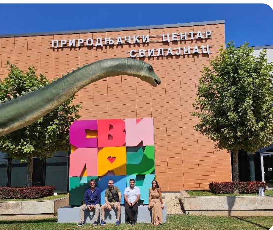
Urva municipality Study Tour to Bosnia and Herzegovina, Serbia and Montenegro

As part of a learning journey for the municipality a study tour was organized to secondary cities of Bosnia and Herzegovina, Serbia and Montenegro to learn about the experiences of local authorities in stimulating tourism, creating local identity and branding and cooperation with local communities.