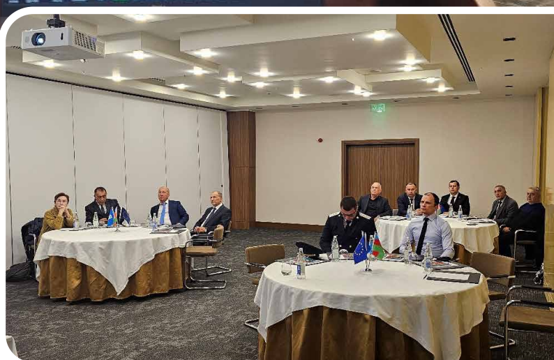
The UIC launch in Azerbaijan

The Urban Learning Center (ULC) was officially launched in Azerbaijan in November 2023, featuring in-person workshops in Lankaran, Mingachevir, Sheki, and Baku. Participation in these sessions extended to representatives from all 55 municipalities of the M4EG Network in Azerbaijan, along with representatives from the Municipality Center of the Ministry of Justice of Azerbaijan. Detailed information on this stream was disseminated to participants, accompanied by the finalization of a work plan for 2024. The launch was joined by the representatives of the EUD team who participated together with the teams from various regions of Azerbaijan. The EU Delegation to Azerbaijan has extended additional support to the LEDP component of the initiative by enlisting an expert to assist municipalities in developing their new generation of LEDPs, now P4EGs.