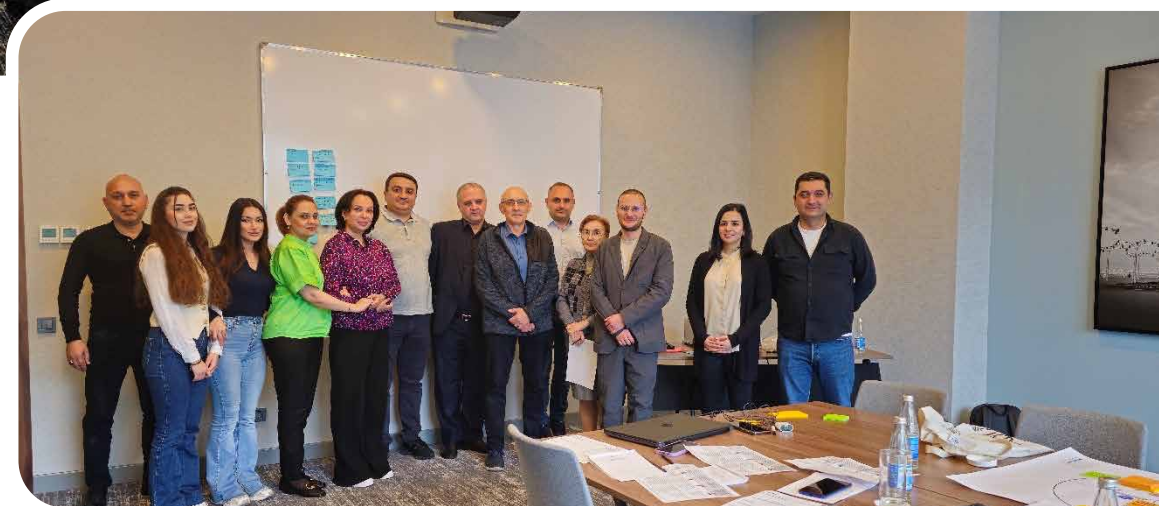
Khirdalan Portfolio Ideation Workshop

Naftalan, Mingachevir and Sabail are in the process of procurement for their initiatives, and we will be looking forward to seeing their ideas become reality.