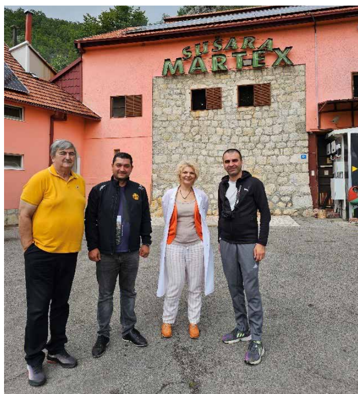
Urva municipality Study Tour to Bosnia and Herzegovina, Serbia and Montenegro