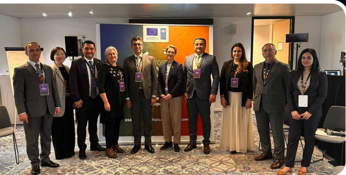
Two above images depict Icherisheher Administration, Khirdalan City Municipality, EU, UNDP and development partners at the Regional Sensemaking Workshop organized by M4EG in April 2023 in Brussels, Belgium