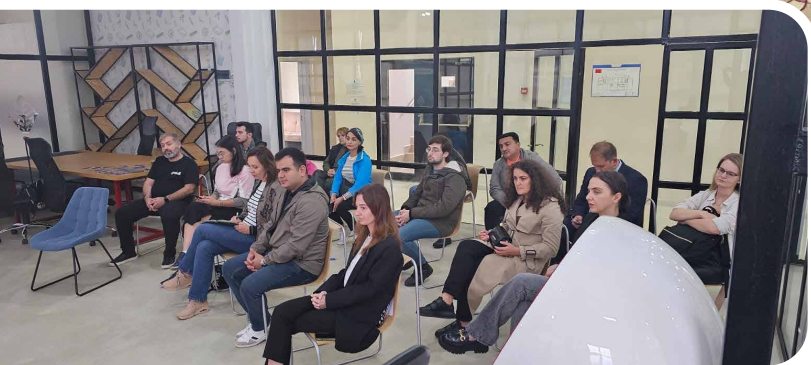
“Deep Demonstrators” from Azerbaijan participated at the Future Fit Cities Urban Forum 2023 organized by UNDP and EU in Batumi, Georgia.