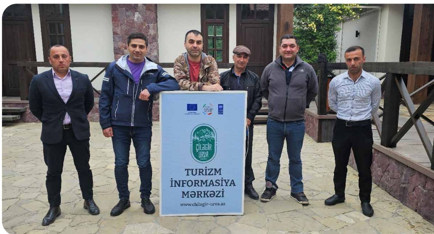
Urva Tourism Information Center

Availability of support from local businesses and State Tourism Agency has helped the municipality in its work towards making Urva a know destination on Northern Tourism route of Azerbaijan.