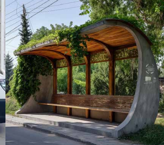
An AI designed bus stop