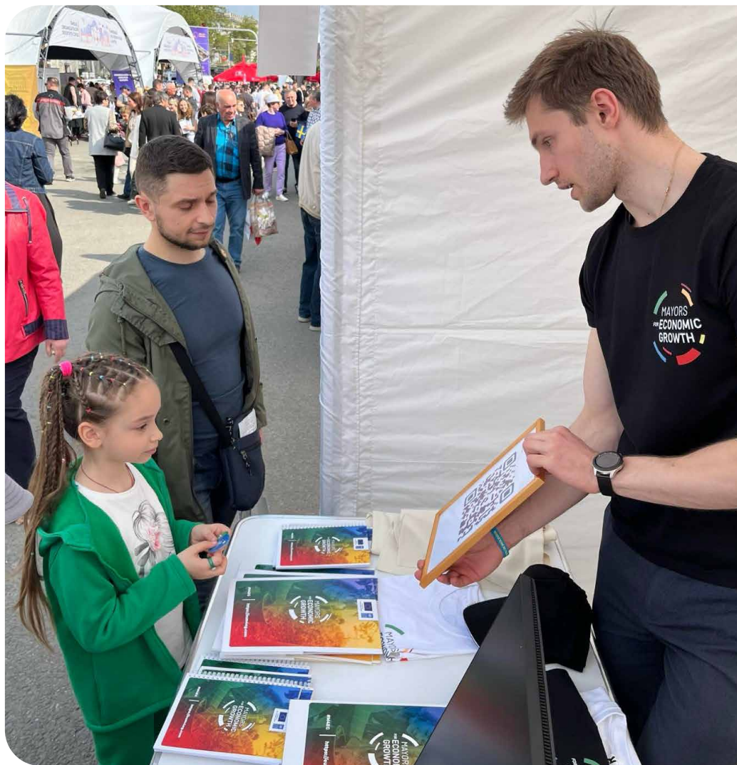
M4EG at the European City event in Chişinău, Moldova

On Europe Day, 9 May, at the European City event in Chişinău, M4EG engaged the public with interactive quizzes highlighting facts and results of local economic development in Moldova. Informative materials were prepared for both adults and children. The main attraction was a contest with questions about improving the development of villages and cities and how residents can contribute to their community's transformation. The most active participants were awarded with prizes.