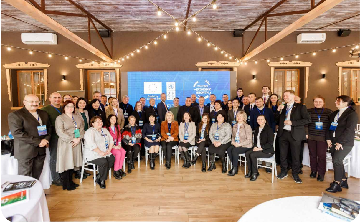
"Future Fit Mayors" event