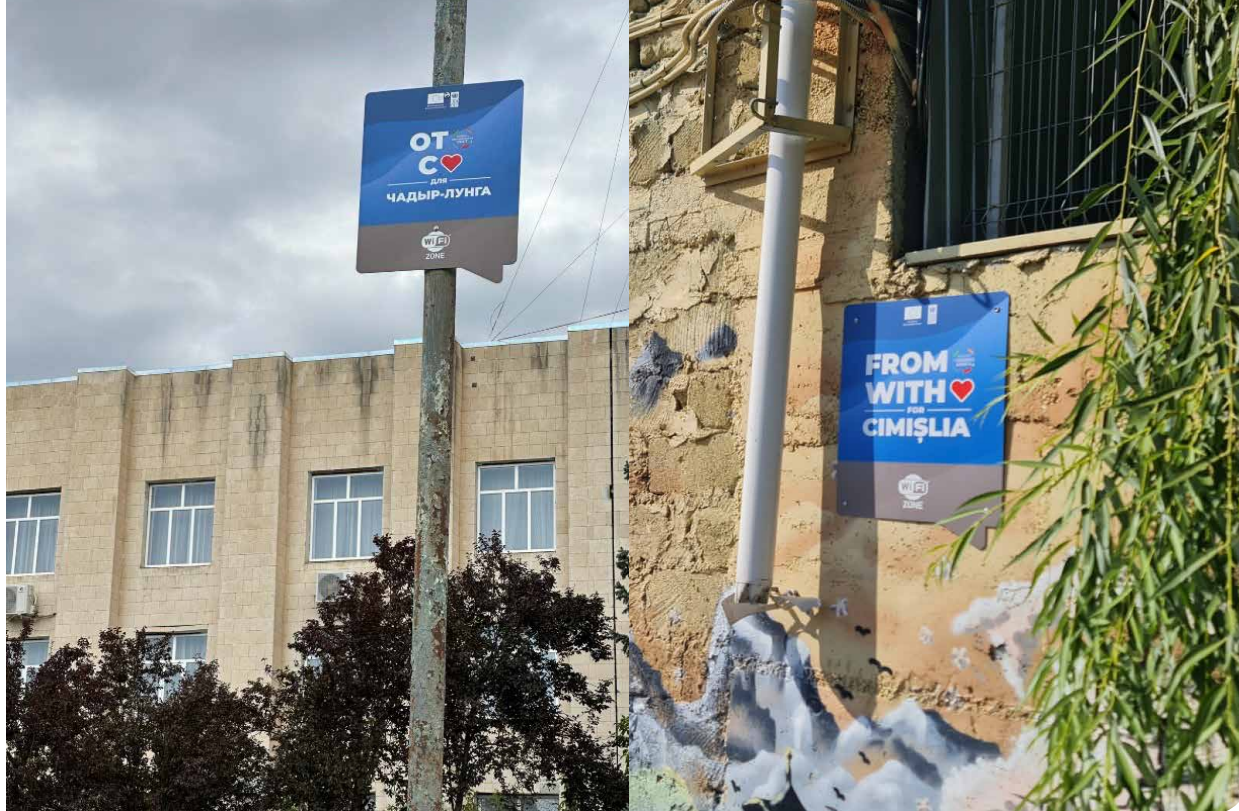
Example of the wi-fi hotspot signs, in Ceadir-Lunga by the City Hall