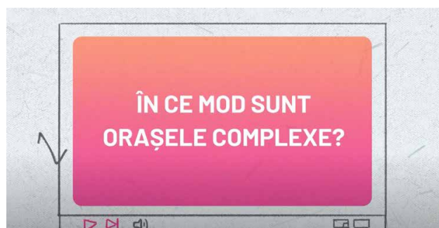
How are city complex [RO]