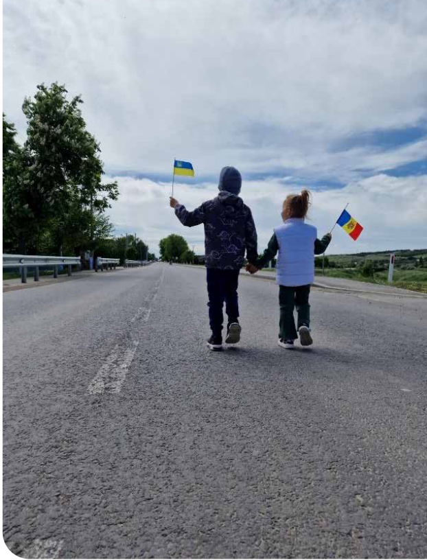
Social cohesion event