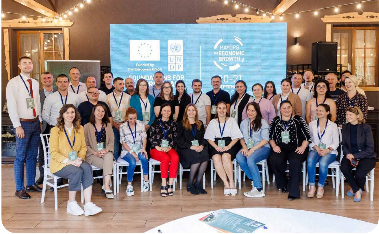
Meeting with representatives of some RM's town halls