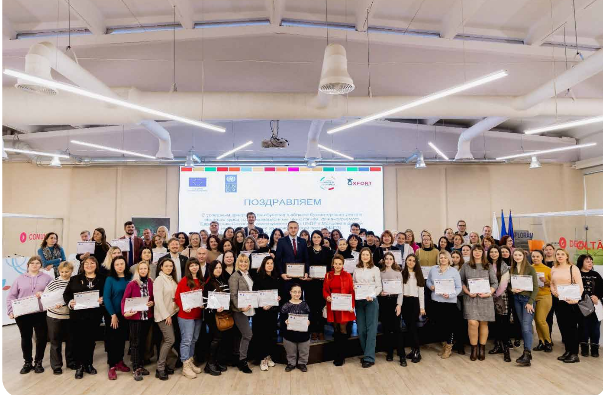
Certificates awarding ceremony with the participation of the UNDP M4EG team and the EU Delegation representative