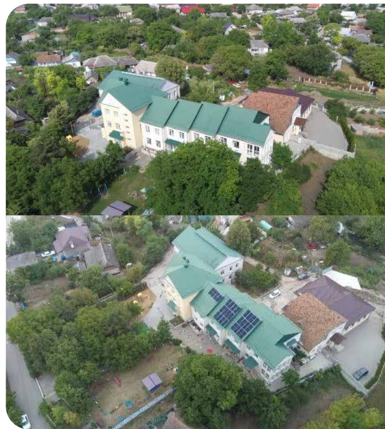
Energy Efficiency interventions at Sireți