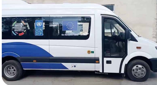
The new public transport vehicles