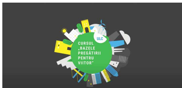
ULC's Foundations for Future Readiness [RO]