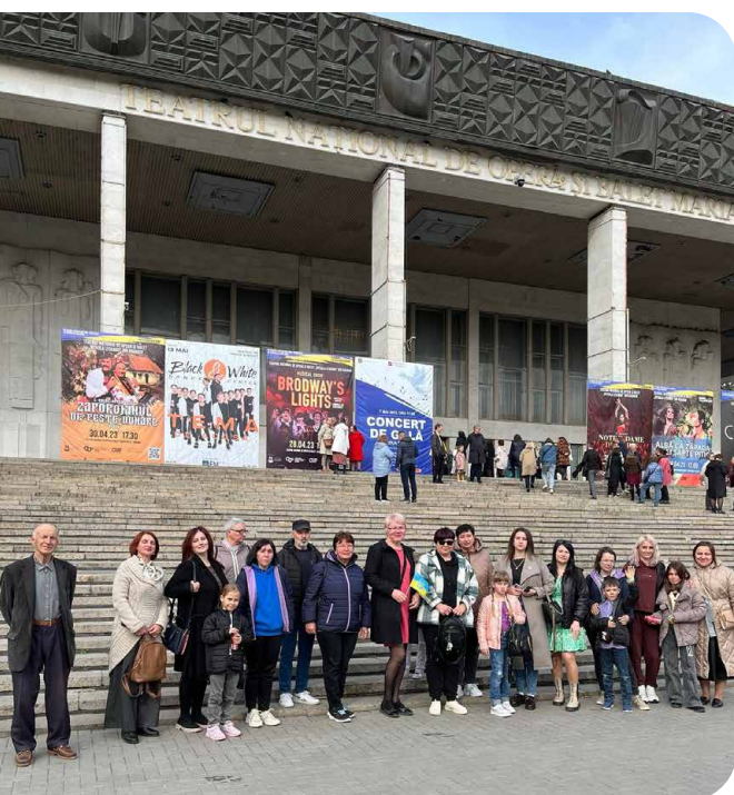
Ukrainian refugees attended a performance of “Zaporozhian beyond the Danube” by the Ukrainian Academic Theater of Opera and Ballet from Kharkiv

Many of the already implemented activities before April 2023 can be found in the 2023 MID-YEAR BRIEF .