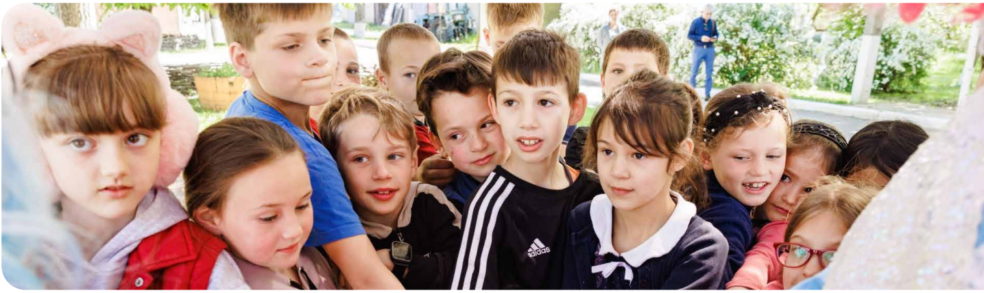
A refugee integration center in Cărpineni