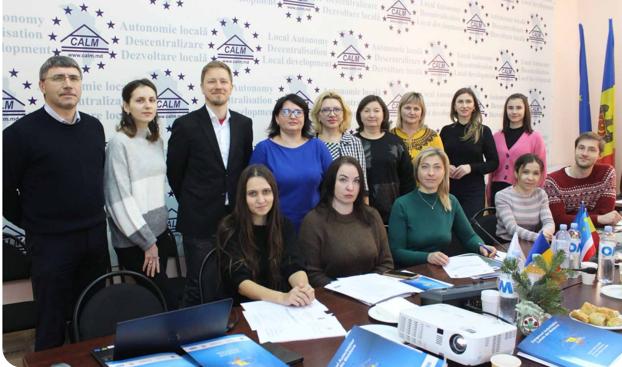
A meeting with Ukrainian Friendship Officers

The deployment of 14 Ukrainian Friendship Officers began in November 2023, set to continue for six months. Strategically placed in Bălți, Cahul, Călărași, Cărpineni, Ceadâr-Lunga, Cimișlia, Copceac, Dondușeni, Drochia, Palanca, Selemet, Strășeni, Telenești, and Ungheni, these officers are at the forefront of our efforts to support and integrate Ukrainian refugees.