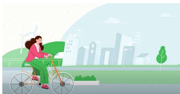
Community Listening [RO]