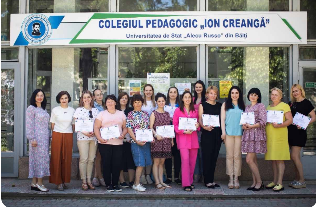
Romanian language courses for refugees from Ukraine