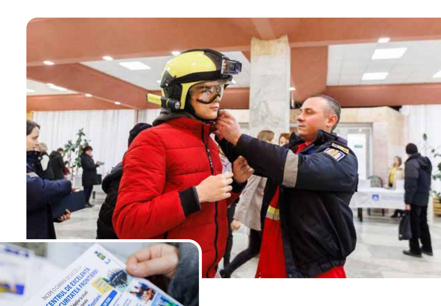
Ungheni (8th of December 2022)

Numerous economic agents and public institutions offered more than 3,000 jobs during job fairs conducted during October – December 2022 in Bălți, Cahul, Căușeni and Ungheni. Men and women from the Republic of Moldova, as well as many refugees from Ukraine attended these fairs. Potential employers have prepared for them information materials in Ukrainian language and a series of socio-economic integration activities.